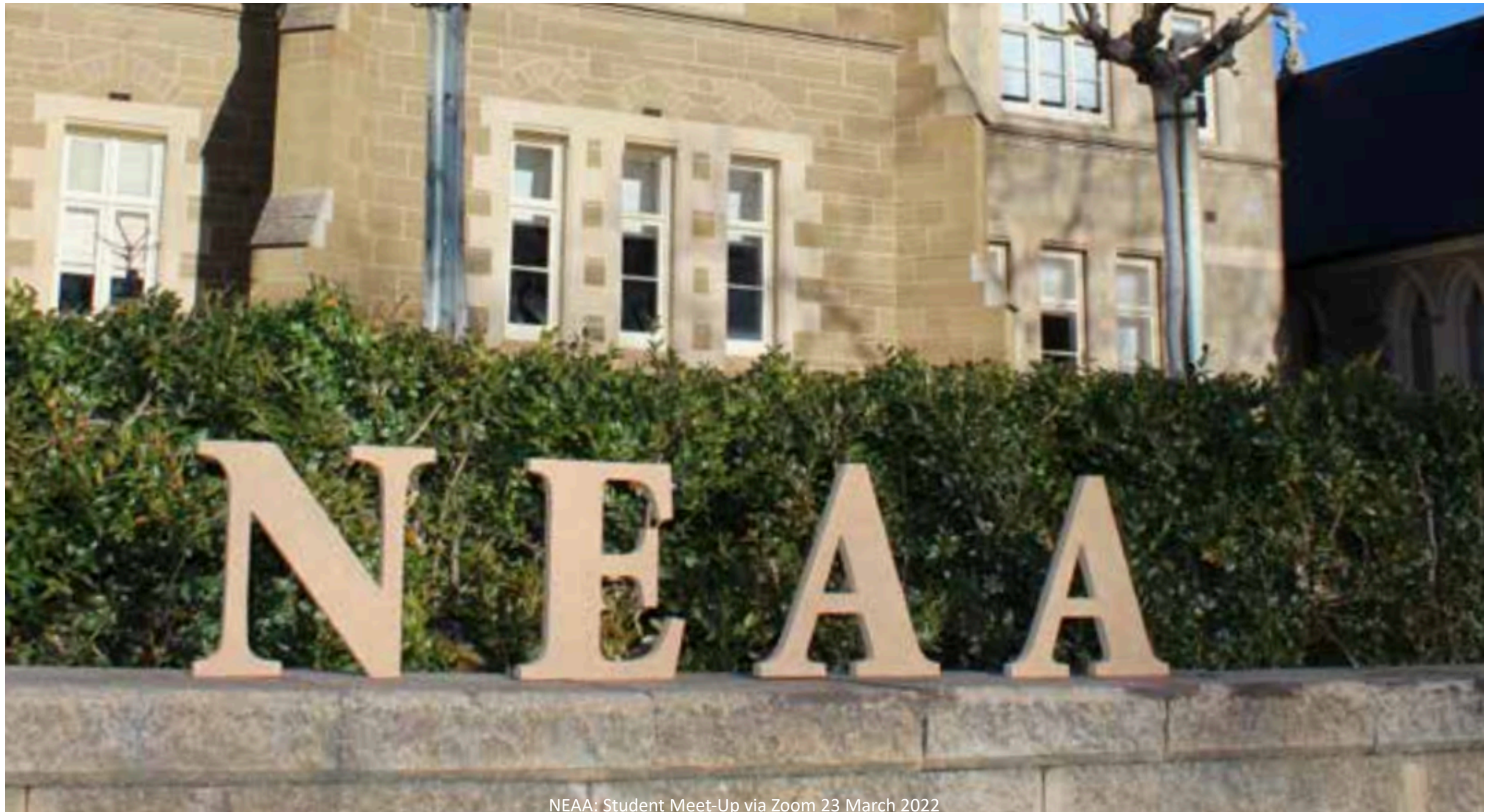
NEEA: Student Meet-Up via Zoom 23 March 2022